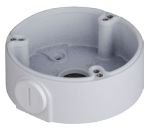
PFA135 Junction box