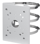
PFA150 Pole mount